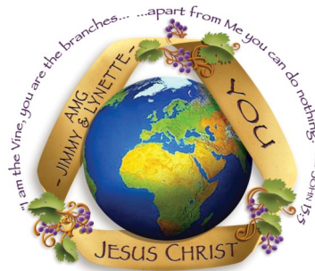
"...in working together with Him." — 2 CORINTHIANS 6:1

Thank You! We want to thank you for your care and support! For those who are praying, please continue. For those who are giving so sacrificially, we thank you and your giving to the Lord is a blessing.