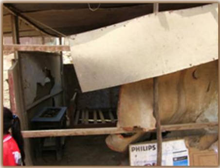
The front "door" of Melanie's house

Melanie's situation is typical of many children in Peru and other areas where AMG provides for sponsored children. It reminds me of the story of the starfish dying on the beach. A boy threw one back into the water. A skeptic nearby mocked, "What difference will that make?" The boy replied, "Made a difference to that starfish!"